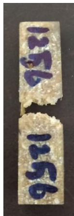
Fig: 3.4 Impact test

Test of ability of a material withstand impact, used by engineers to predict its behaviour under actual conditions. Many materials fail suddenly under impact, at flaws, cracks, or notches. The most common impact tests use a swinging pendulum to strike a notched bar; heights before and after impact are used to compute the energy required to fracture the bar (see strength of materials). In the Charpy test, the test pieces is held horizontally between two vertical bars.