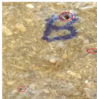
Fig: 3.3 Shore hardness test

Shore hardness is a measure of the resistance of a material to penetration of a spring loaded needle-like Indenter. Hardness of hard elastomers and most other polymer material (Thermoplastics, Thermosets) is measured by Shore D scale. Shore hardness is tested with an instrument called Durometer.